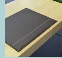
Leather table mats