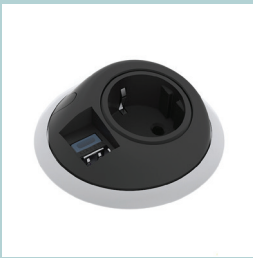
Power socket SHZ004