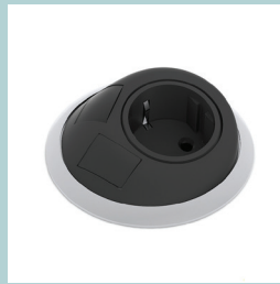
Power socket SHZ005