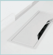
Metal grommet: 317x119 mm, H=27 mm